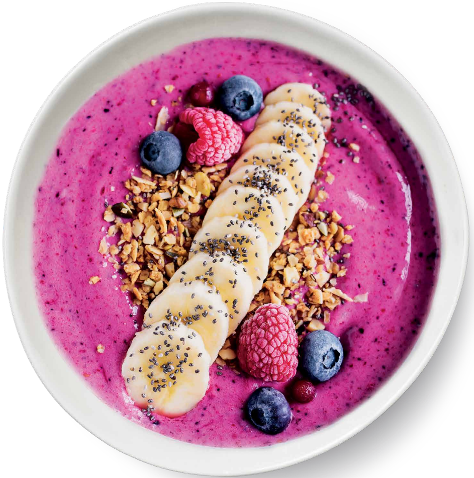
Berry Mint Bowl